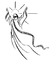
Resurrection of Our Lord Roman Catholic Church

or the offertory collection basket on the weekend of September 11/12.